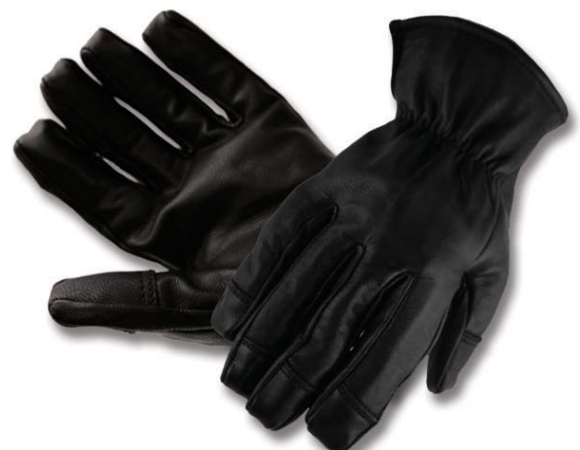
4046 GENERAL SEARCH & DUTY