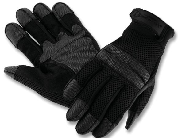
4045 GENERAL SEARCH & DUTY